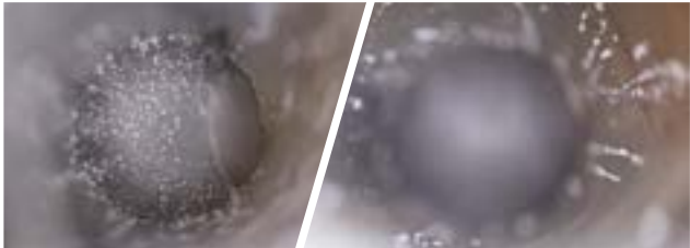
far range close range

The motor driven focus can be adjusted by touchscreen or joystick.