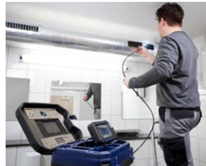
Easy inspection of ventilation systems with the 100 foot camera rod