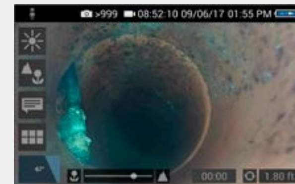
High Definition Display (Wöhler VIS 700): razor sharp images