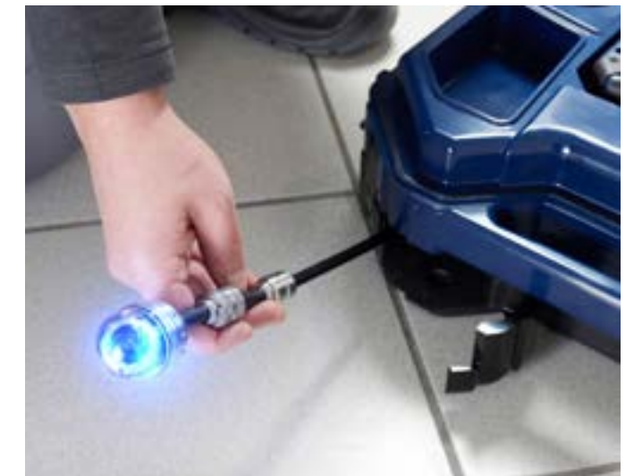
The 100 foot camera rod is at the same time flexible and durable because of its construction