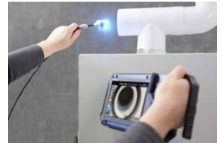
Inspection of flue gas lines from 2": easily negotiates tight bends of 87°